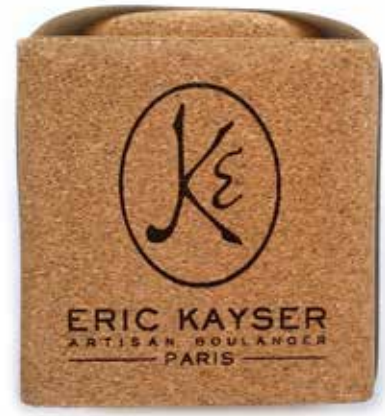
EXAMPLE OF CUSTOMIZATION